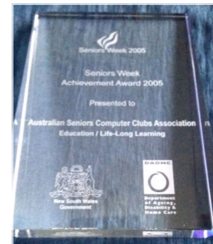
Left: This 2005 NSW Seniors Week Achievement Award is just one example of the appreciation of the work that ASCCA and ASCCA Clubs have done for Seniors Week Celebrations in all states.