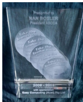
2008 - 2011 Appreciation "Take the Teacher Home"