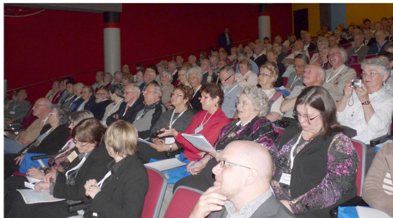
The audience of mainly ASCCA Club members, listening with interest to a speaker in the Coles Theatre at the 2010 ASCCA Conference which was held at the Powerhouse Museum in Sydney

This year we are celebrating 20 years of the work of ASCCA's wonderful "army" of volunteers and a smaller number of paid staff, who have achieved great things for Australian seniors. A sense of